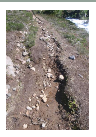
South Breitenbush Trail