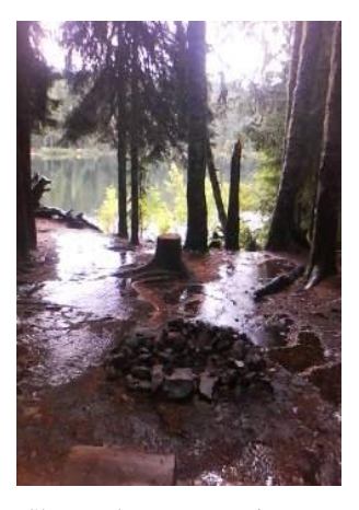
Short Lake – compaction at dispersed site