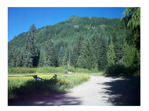
Campsite designation, toilet installation, traffic control and meadow protection