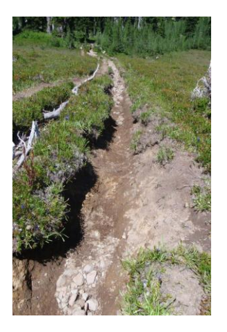
Pacific Crest Trail