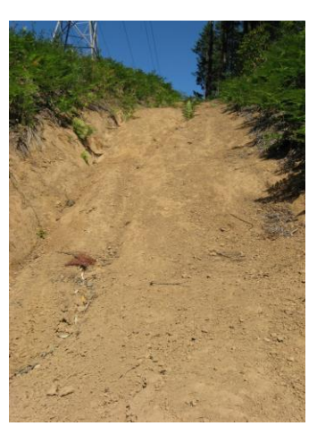
Power Line Roads