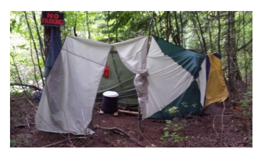
User created latrine