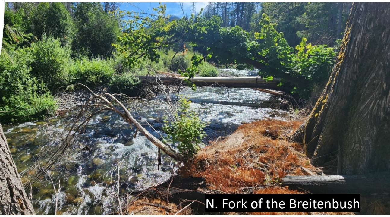
N. Fork of the Breitenbush