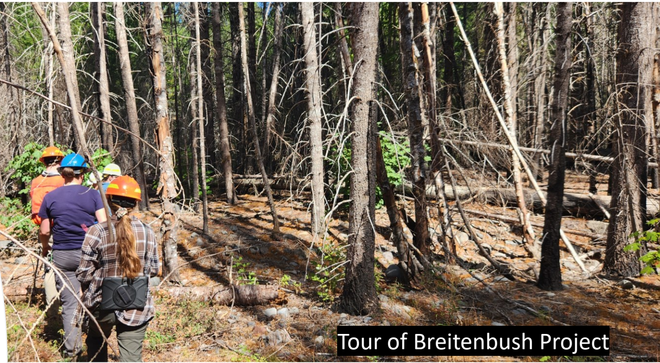
Tour of Breitenbush Project