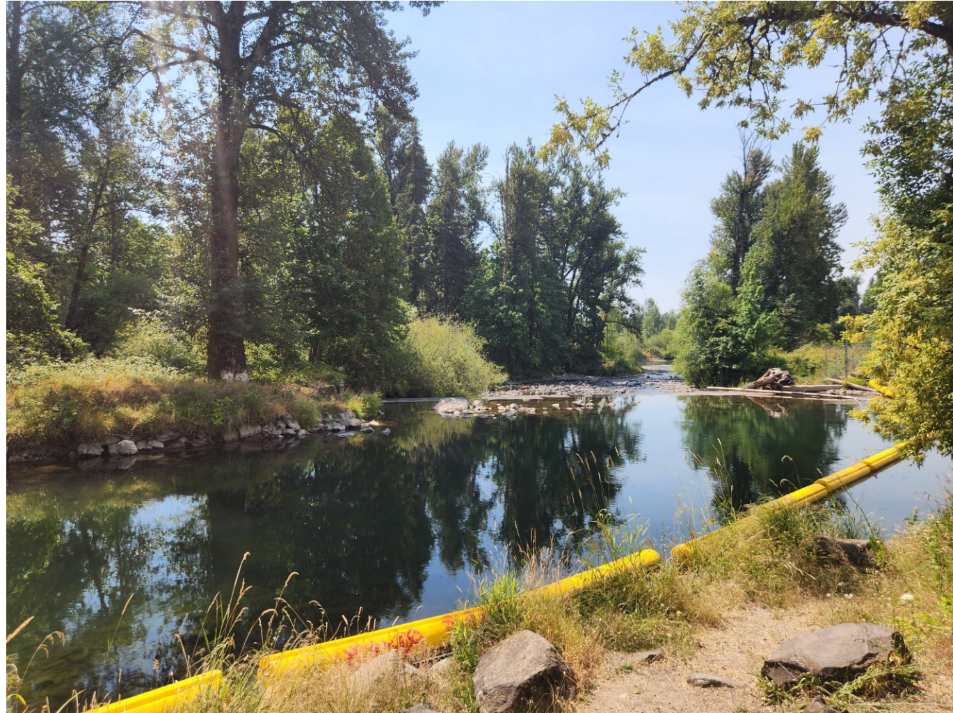
Near Lower Bennett Dam